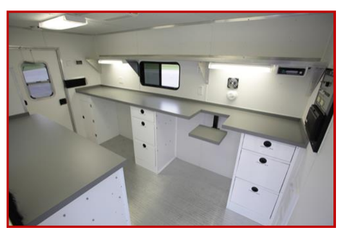
Fiber Optic Splicing Trailer

Provides ample room for a controlled splicing environment and plenty of storage for all your fiber optic supplies.