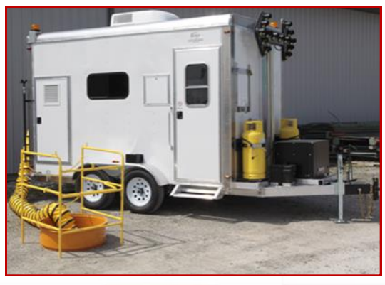
Fiber Optic Splicing Trailer

Designed by fiber optic splicing technicians, this trailer protects workers from mother natures worst. Equipped with all your needs for splicing efficiency.